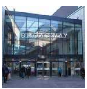
Broadway Shopping Centre in Bradford