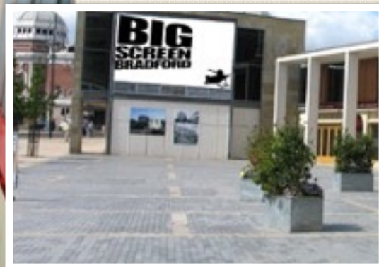
'LIVE' PLAY-OUT OF THE BRIEF ENCOUNTERS PERFORMANCE ON THE BRADFORD BIG SCREEN