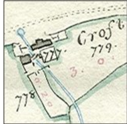
Image: detail from plan of field areas in Low Green Field, Langstrothdale, North Yorkshire, by Sam Swire, mid 19 th century.

Raistrick Archive web page: http://www.brad.ac.uk/library/special/raistrick.php