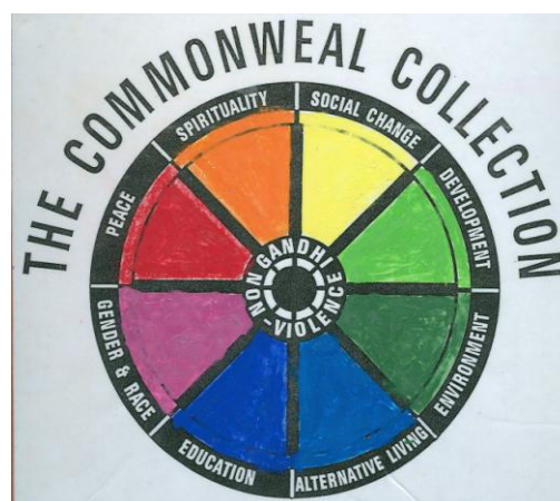
Image: hand-coloured diagram showing the subjects covered by Commonweal.

The PaxCat Project will raise external funding to catalogue these remarkable archives, enabling us to bring them to a much wider audience.