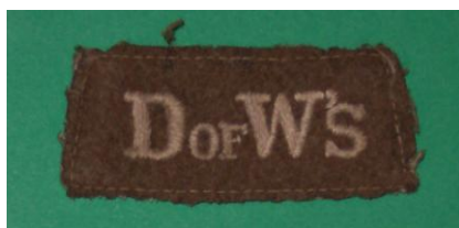
Image: Priestley's shoulder tab, from his time in the Duke of Wellington's West Riding regiment during WW1.

Great Northern Books, who have already reprinted several novels by J.B. Priestley, have published a new book, "Priestley's Wars", by Neil Hanson, which follows Priestley's journey through war and peace, from enthusiastic World War 1 volunteer, to inspiring broadcaster during World War 2, to his essential role in the founding of the Campaign for Nuclear Disarmament. The book uses many of Priestley's writings, most exciting of which are his vivid and moving letters home from the trenches, never before in print.