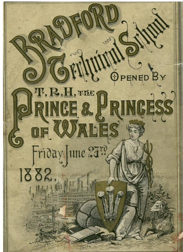
Image: detail from programme for the 1882 Opening of the Bradford Technical School by the Prince and Princess of Wales. The "goddess" appears to depict Bradford: she is surrounded by materials of the textile industry, wears a mural crown, and carries a caduceus, to signify Hermes, patron of merchants.

In summer 2008, we were delighted to lend items from the Bradford Technical College Archive to an exhibition organised by Bradford College to celebrate the heritage of 175 years of technical, and later higher, education in Bradford.