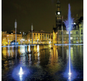
Mirror pool in City Park, Centenary Square, Bradford