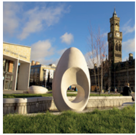
Centenary Square, Bradford city centre