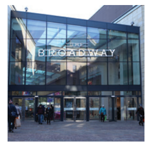
Broadway Shopping Centre in Bradford